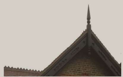
Finial and ridge tile detail