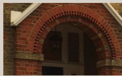
Front door special brick arch

Architectural details to be used on street elevation to ensure the building fits in with the other villas completing the street scene. All images from other villas on Lingfield Road