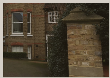
Front garden wall and bay detail